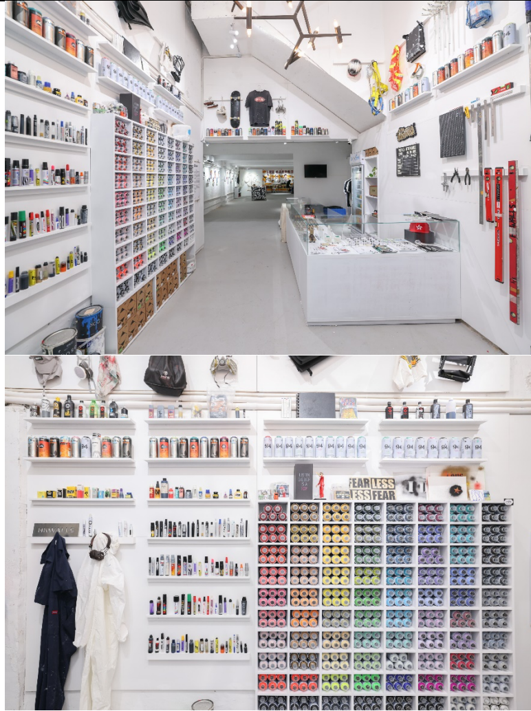
In collaboration with HKWALLS, “Art Too” features a special edition of the “Tools of the Trade” Exhibition at the G/F of 5 Sharp Street East.