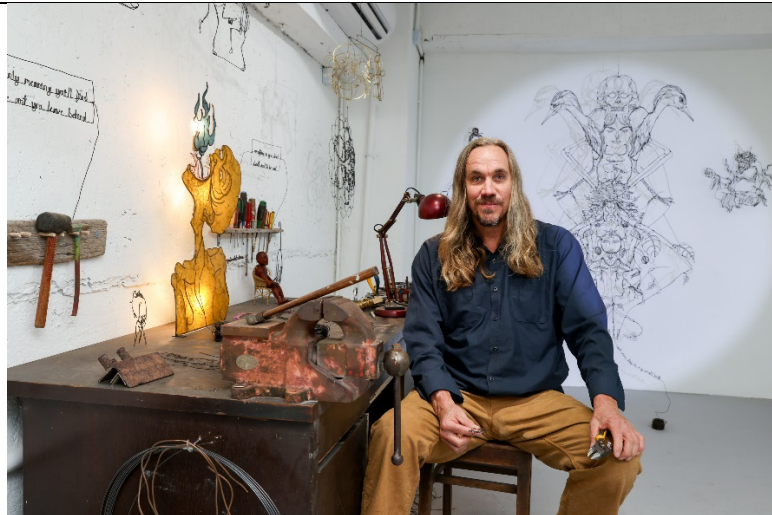
U.S. artist Spenser Little