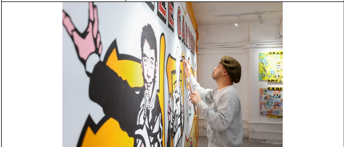
Street artists will demonstrate techniques for workshop participants to get hands-on experience with tools of the trade, including brushes, markers and stencils.