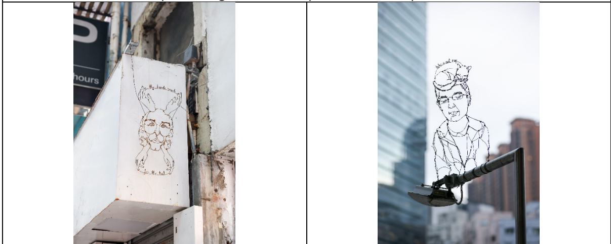
U.S. artist Spenser Little, known for creating sculptures modelled with a single continuous wire, will create site specific installations in the Lee Gardens Area.