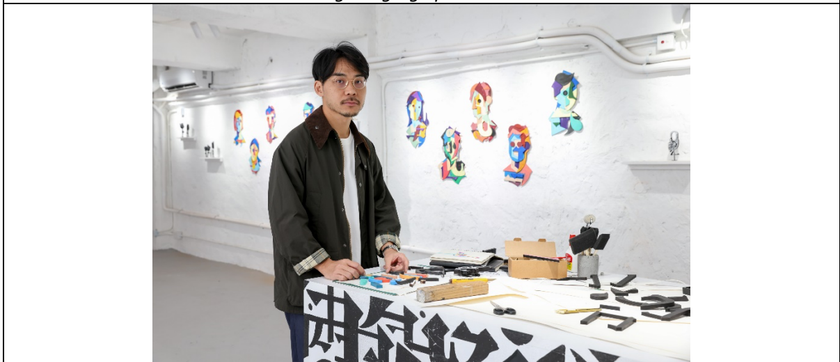
Fine artist Wong Ting-fung